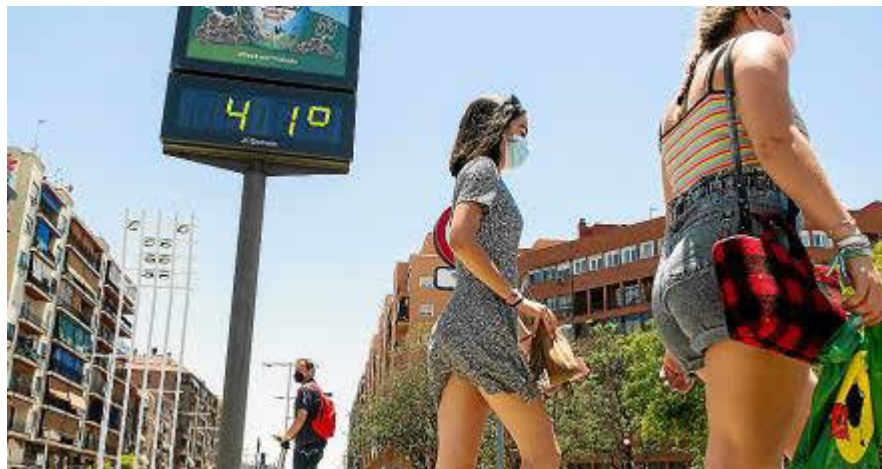
A warmer than usual summer.

In June, the average was 23.1C, which was 1.3 degrees higher than usual. August had the highest average - 26C and