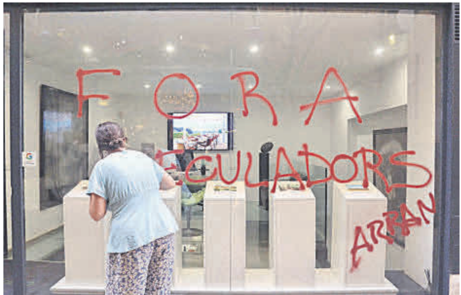
An international estate agency in Palma was the latest to be targeted.