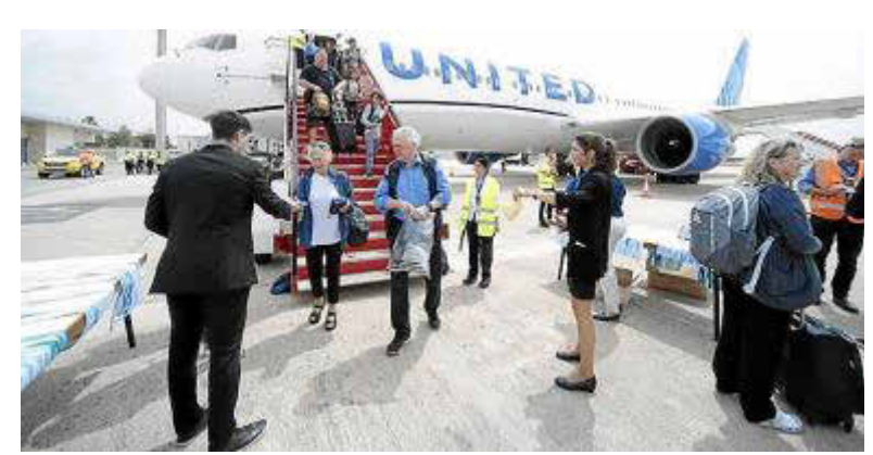
First U.S. tourists arrive on the island on direct flight last year.

into the Balearic and Spanish tourist industries. The U.S. market is becoming increasingly important for the island since the launch of direct flights from New York last year. The flights are due to restart again shortly.