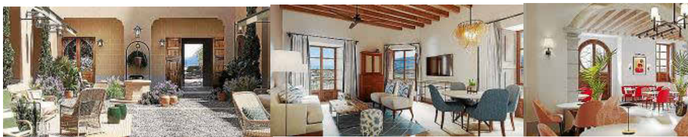
The new hotel at Banyalbufar will open in June of this year. A gala opening ceremony is being planned.

Palma.—Sir Richard Branson has launched a recruitment drive for 60 staff at his new Mallorca hotel, Son Bunyola, which will open on June 16.