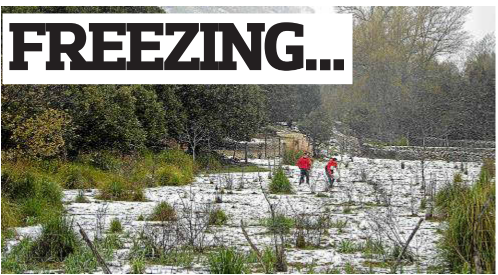
More snow fell overnight and freezing temperatures gripped Majorca yesterday on the first day spring. See Forecast Inside Today.