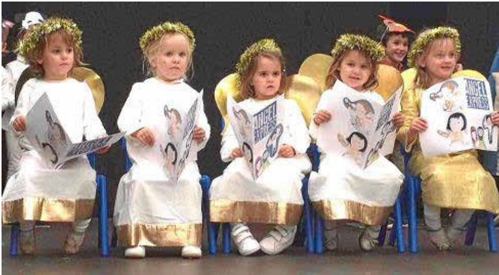
Junior Bulletin section: Inside