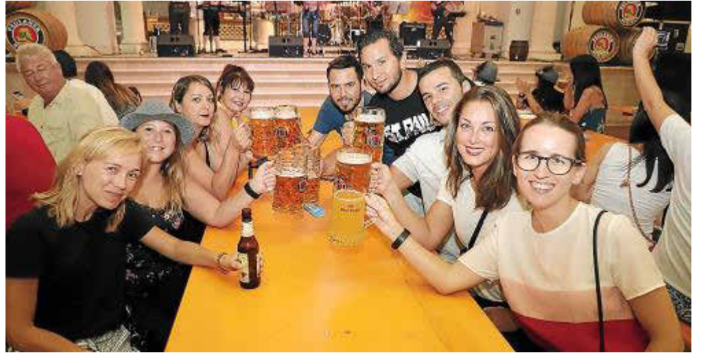
Cheers to beer festival: Inside