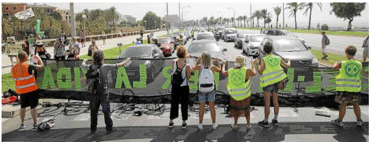
Yesterday morning's Extinction Rebellion demonstration in Palma.

A statement said: "The international movement returns to the street in response to the inaction of governments in Majorca and at national and international levels in the face of the sixth mass extinction and the radical depletion of resources."