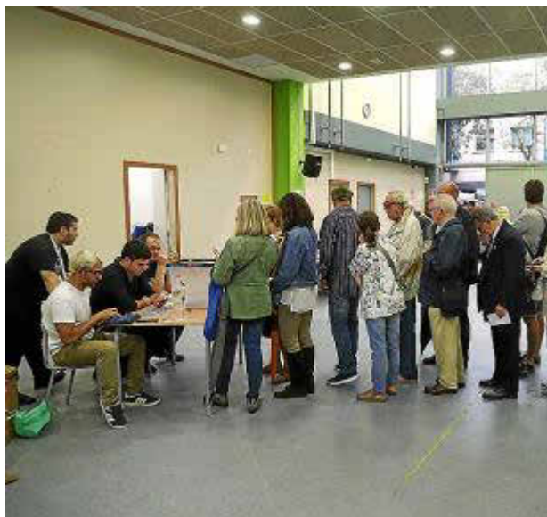
Municipal elections are to be held next month.

For the regional parliament election, for which foreign residents do not have a vote, 801,595 people are registered. Of these, 27,695 are living abroad.