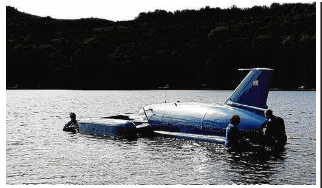
Bluebird was finally back in the water yesterday.

The record-breaking hydroplane was floated as part of tests being carried out on Loch Fad on the Isle of Bute. It has been rebuilt after being recovered from the bottom of Coniston Water in 2001, following Campbell's fatal crash in 1967. The 45year-old died trying to break his own water speed record when the Bluebird K7 flipped and crashed. A group of volunteers from Tyneside are testing the iconic craft to see if it is watertight and whether it can withstand a buffering from the waves.