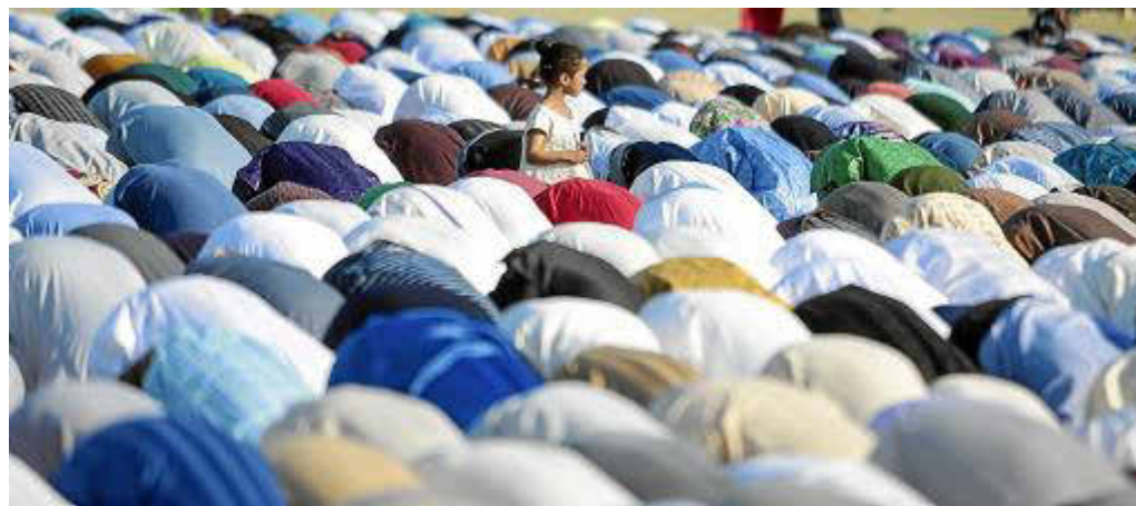
Muslims celebrating Eid al-Fitr in Palma yesterday.

● Thousands of members of Majorca's Muslim community gathered in Palma yesterday to mark the end of Ramadan which began on 16 May. Eid al-Fitr is one of two major festivals in Islamic faith and sees Muslims hold prayers and give money to poor. The festival signals an end to the holy month of Ramadan, during which Muslims fast from sunrise to sunset.