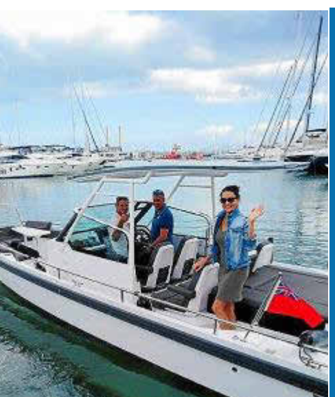
Enjoying Majorca at sea: See our weekly nautical feature: Pages 8 & 9 Inside

Friday, June 15 2018 1.20€ · Founded 1962 · N.16616 · Passeig de Mallorca 9 A, Palma 07011