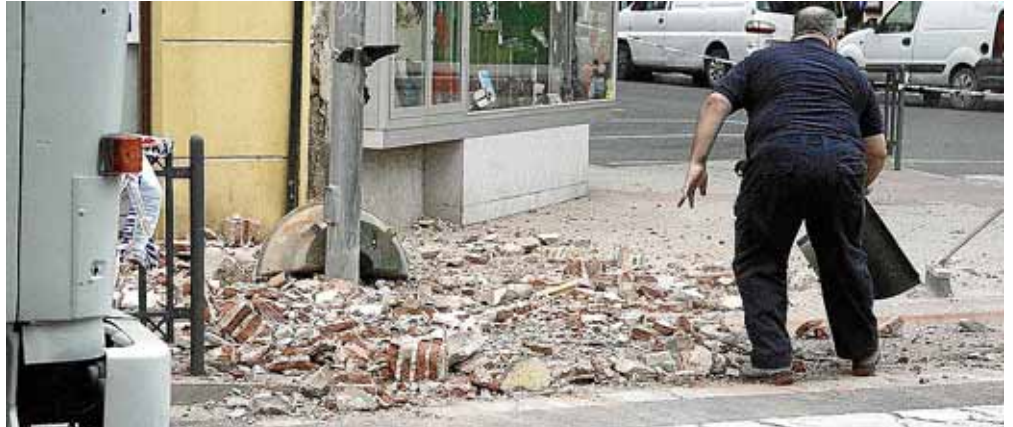
Major damage after Spain earthquake: SEE PAGE TEN

1.10€ · Founded 1962 · N.15877 · Passeig de Mallorca 9 A, Palma 07011