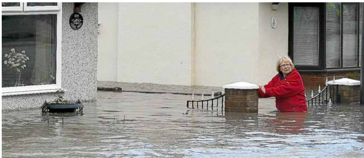
TWO DEAD AS HURRICANE-FORCE WINDS HIT BRITAIN: PAGE 11

FORMER PRESIDENT OF THE BALEARICS FOUND GUILTY OF BRIBERY: SEE PAGE 7